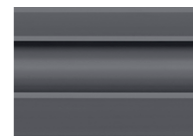
JOHNSONITE MILLWORK WALL BASE AMBASSADOR TA6 BEDROCK