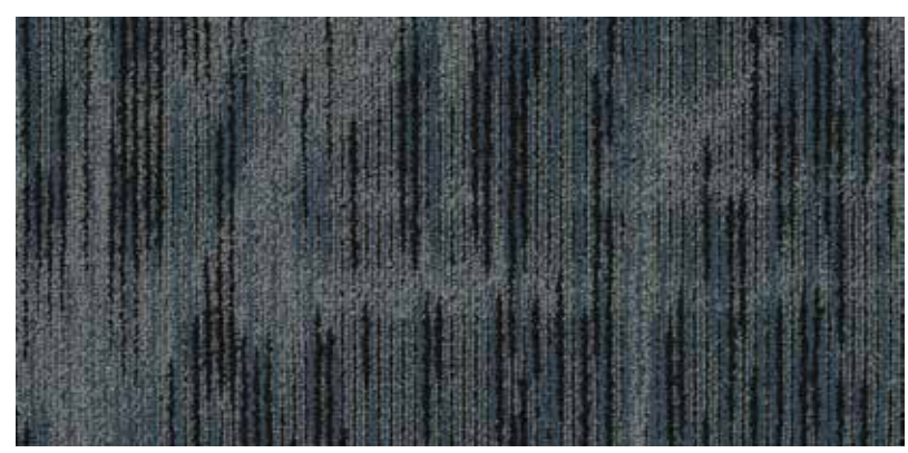
SOFT SURFACE POWERBOND | MODULAR TILE MENTOR 11686 BE KIND 20506