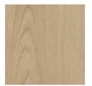
PNP 8715 NATURAL