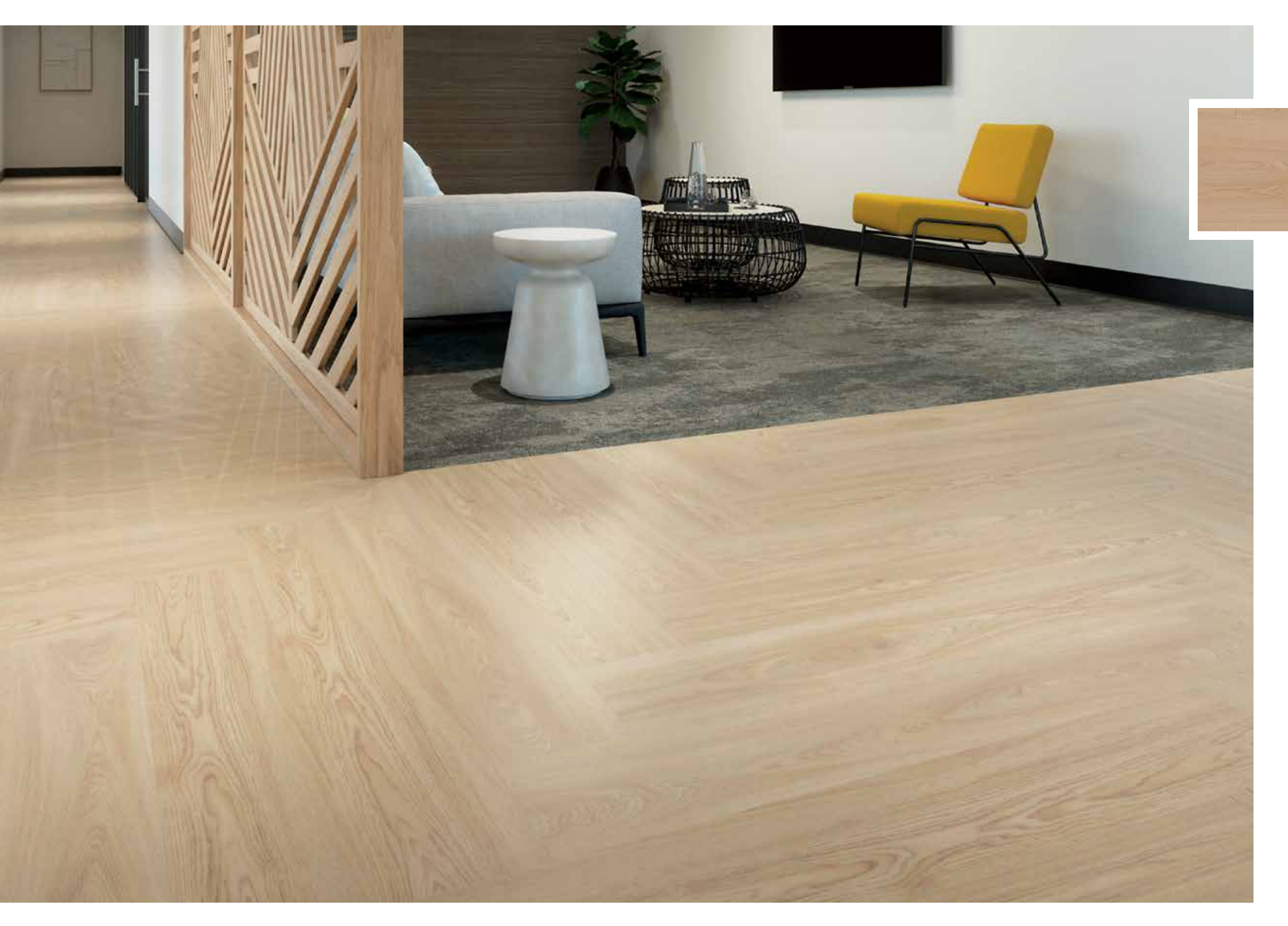
CITIZEN OAK PNP 8715 NATURAL