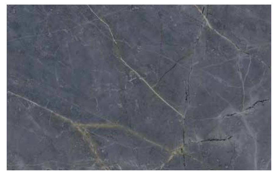
EVEN PLANE LVT MARBLE PULPIS GOLDEN BLACK PNS 8700