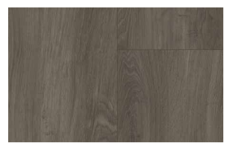
EVEN PLANE LVT ENGLISH OAK DARK GREIGE PNP 8707