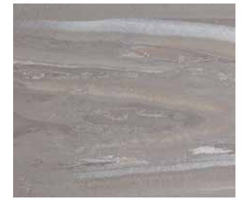
JOHNSONITE RUBBER TILE MINERALITY META PA8