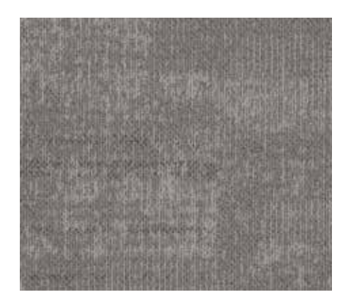
SOFT SURFACE POWERBOND | MODULAR TILE LIGHT SHIFT 11524 WHITE OUT 45403