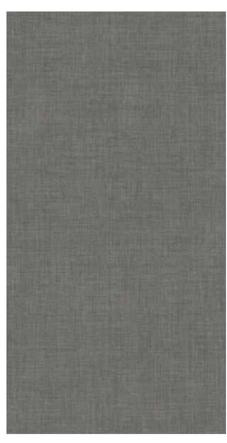
EVEN PLANE LVT TISSE MEDIUM GREY PNA 8816