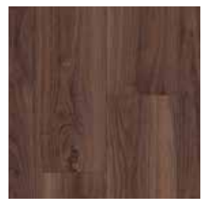
PNP 8710 WALNUT