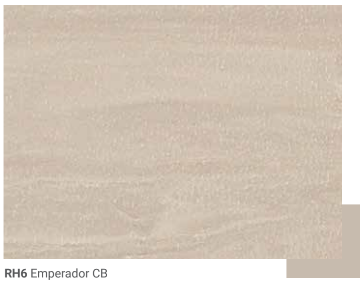
31 Zephyr CB *