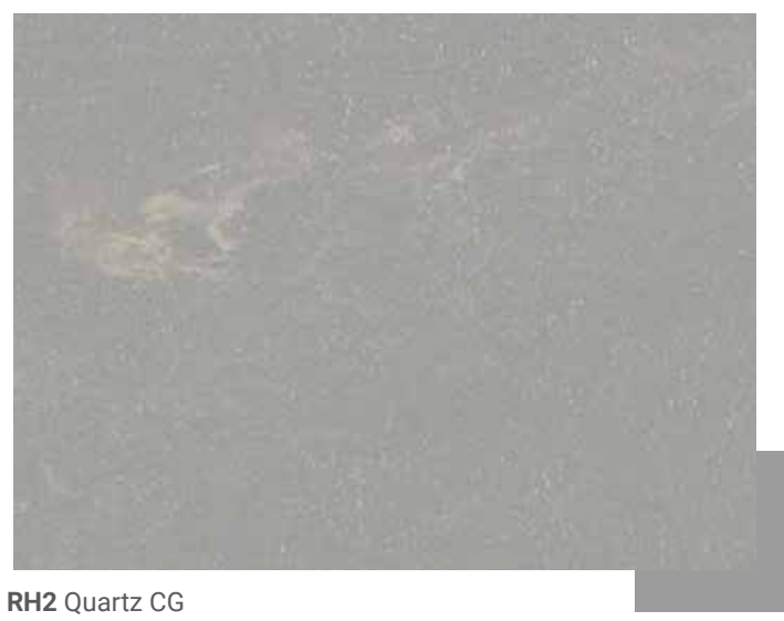
TA5 Colonial Grey CG *