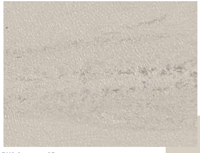
RH8 Quantum CB 24 Grey Haze WG *