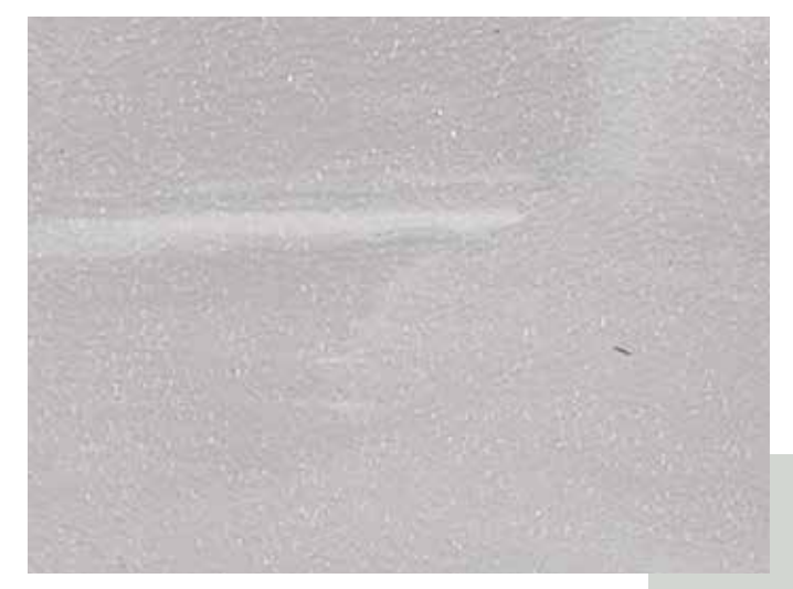
RH1 Marbra CG 23 Vapor Grey CG *