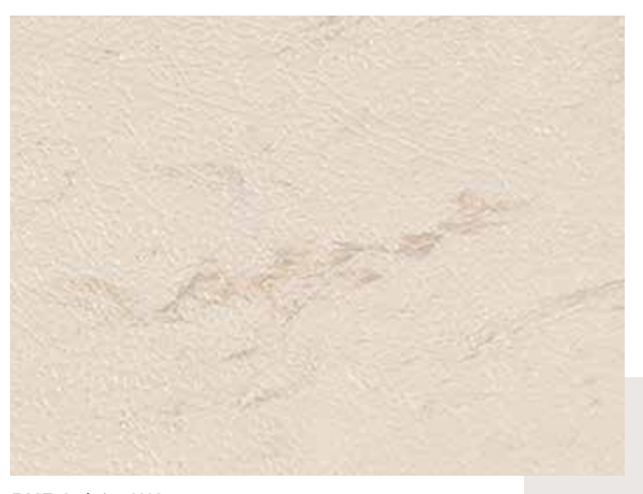
RH5 Calcite WG 27 Mist WG *