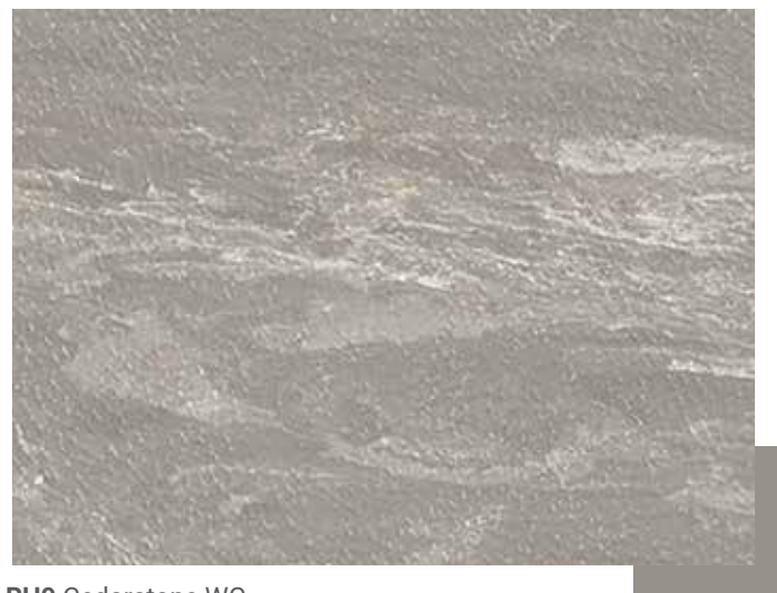
RH9 Cedarstone WG 32 Pebble WG *