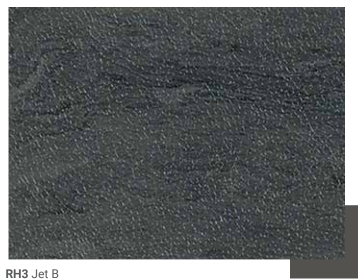
20 Charcoal WG *