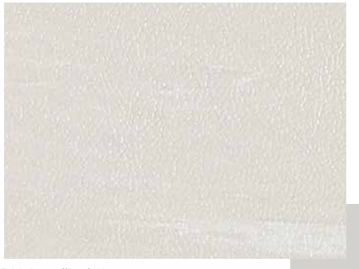
RG9 Crystallized W TB3 Dover CG *