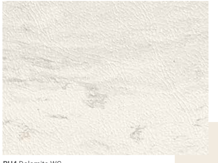
RH4 Dolomite WG 460 Cotton W *