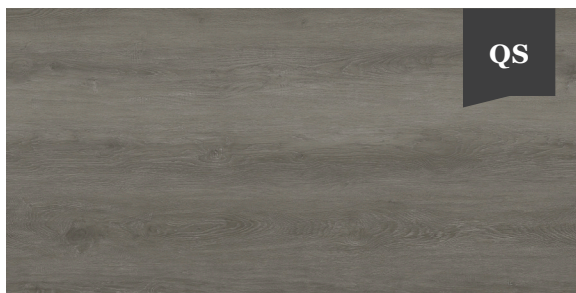
Slate 0005 7" x 48" and 7" x 60"