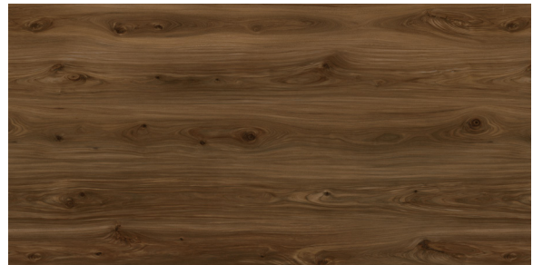
Cocoa Elm 0012 7" x 48" and 7" x 60"