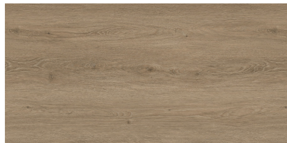
Ashwood Oak 0008 7" x 48" and 7" x 60"