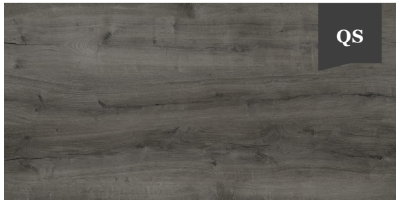
Charcoal 0003 7" x 48" and 7" x 60"