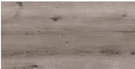
Drift Oak 0013 7" x 48" and 7" x 60"