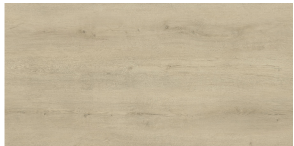
Ecru Oak 0014 7" x 48" and 7" x 60"