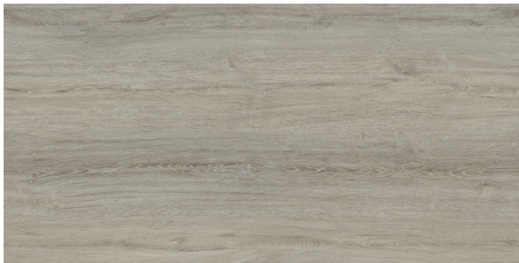
Cerused Oak 0011 7" x 48" and 7" x 60"