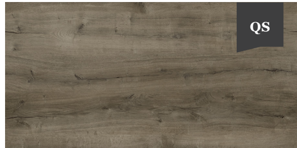
Fog 0004 7" x 48" and 7" x 60"