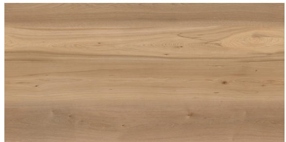
Willow 0022 7" x 48" and 7" x 60"