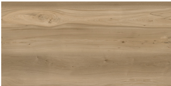
Fawn Elm 0015 7" x 48" and 7" x 60"