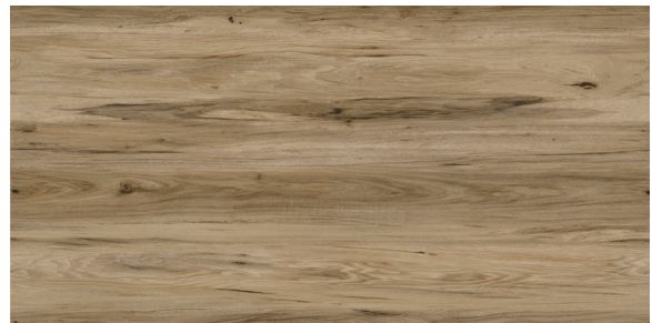
Fumed Hickory 0016 7" x 48" and 7" x 60"