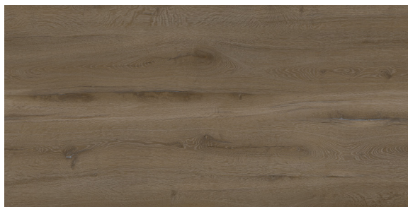
Alder Oak 0007 7" x 48" and 7" x 60"