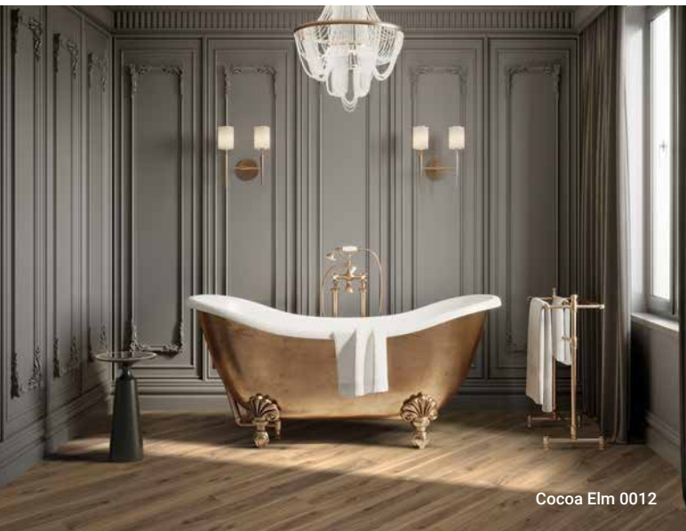
Cocoa Elm 0012

comfort underfoot. But our favorite part of Accore™ is its quiet disposition—with an IIC rating of 68 that lets you welcome guests with a tranquil escape.