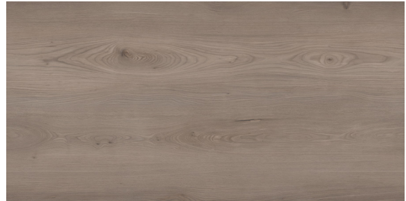
Canyon Elm 0010 7" x 48" and 7" x 60"