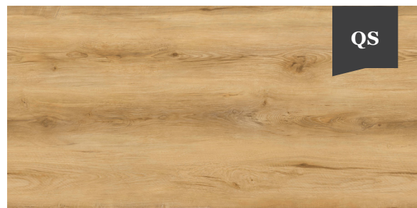
Warm Birch 0006 7" x 48" and 7" x 60"