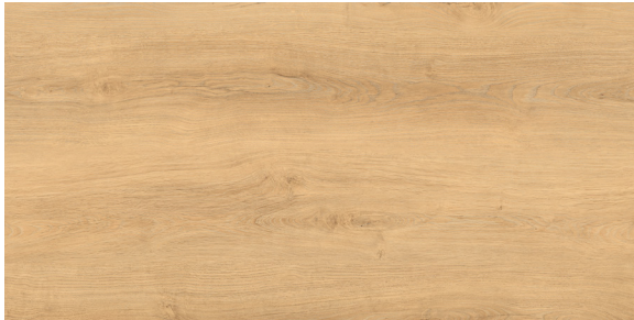
Blush 0009 7" x 48" and 7" x 60"