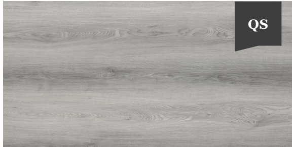
Ashen 0001 7" x 48" and 7" x 60"