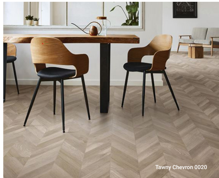
Tawny Chevron 0020