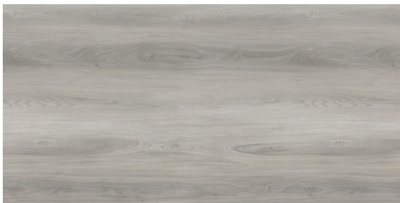
Vale Oak 0021 7" x 48" and 7" x 60"