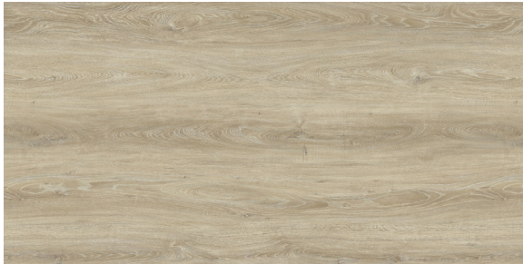
Limed Oak 0017 7" x 48" and 7" x 60"