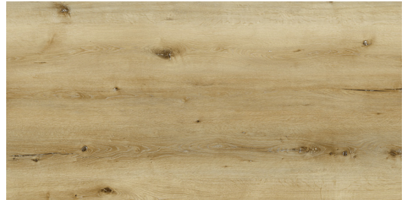
Natural Oak 0018 7" x 48" and 7" x 60"