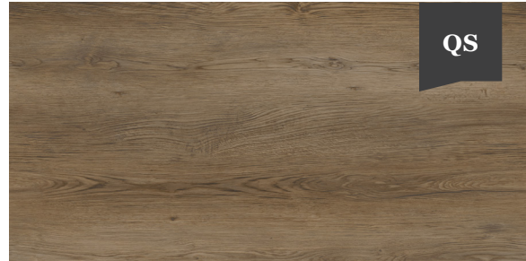
Barrel 0002 7" x 48" and 7" x 60"