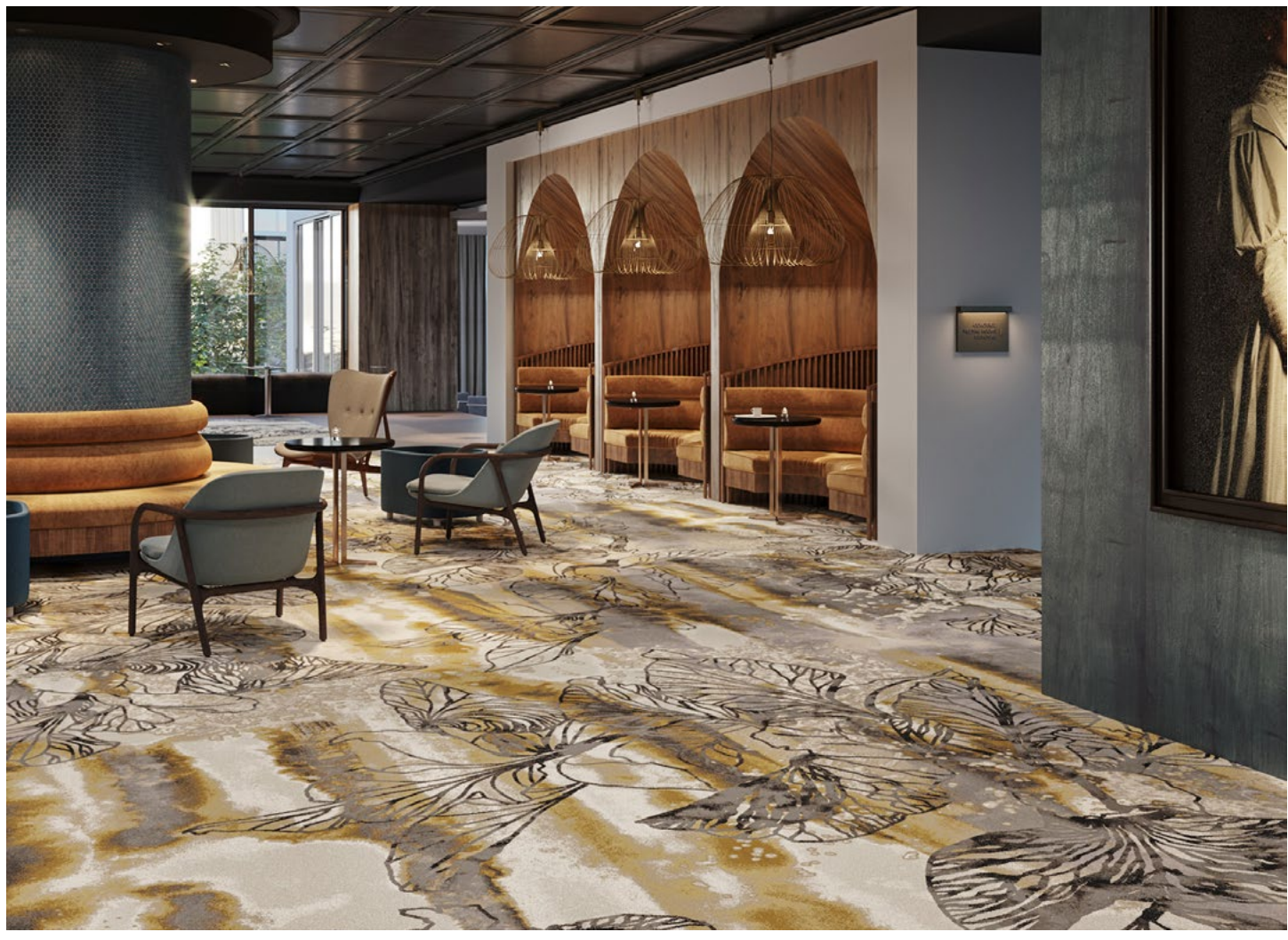
MARIEKE X MA010-1030