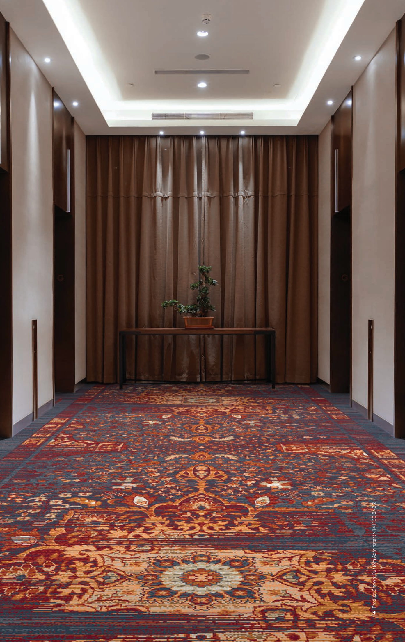
▲ Product Shown: Custom Axminster (N14113E8N06)