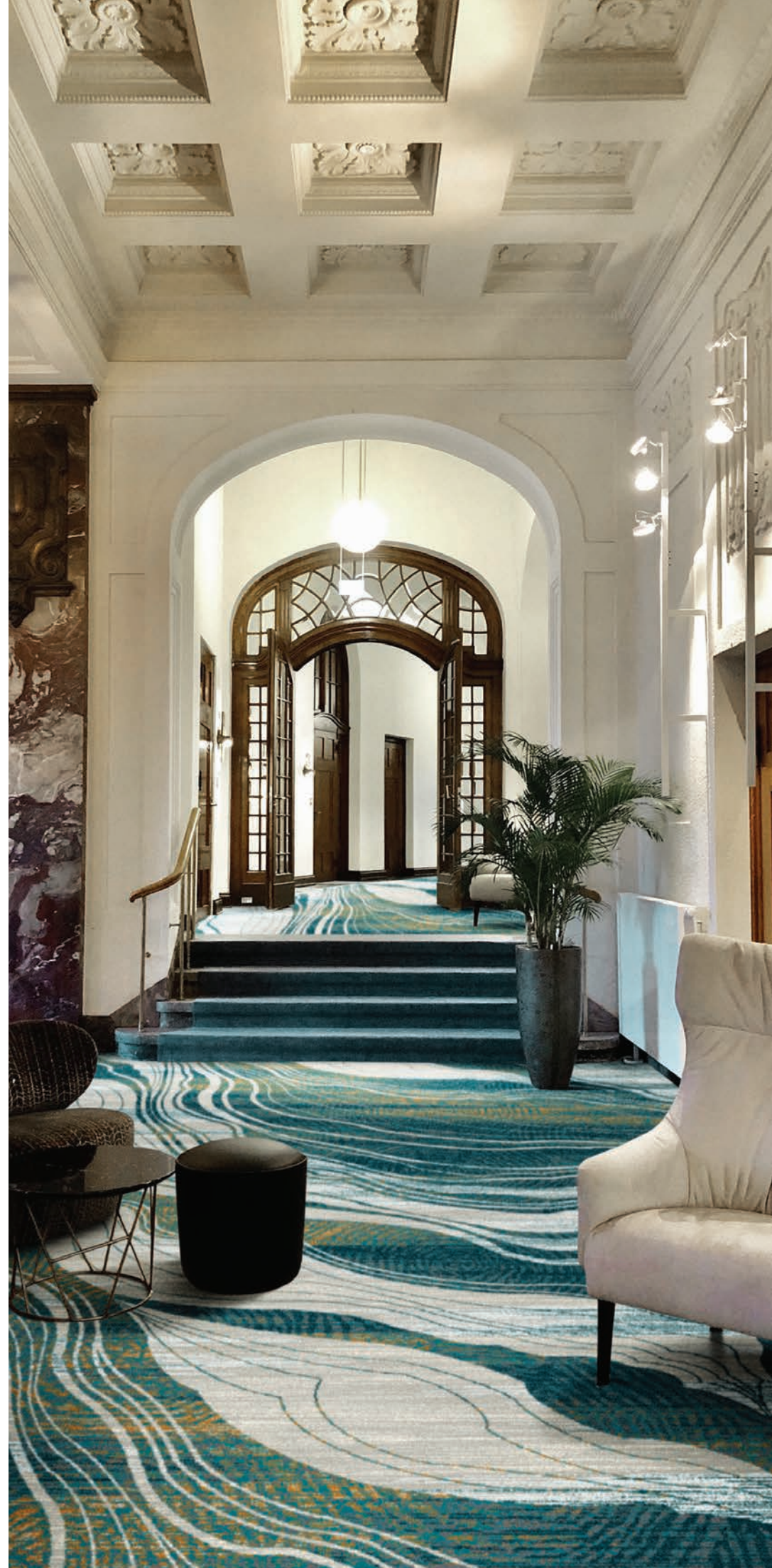
▲ Product Shown: Custom Axminster (AX1177-9)