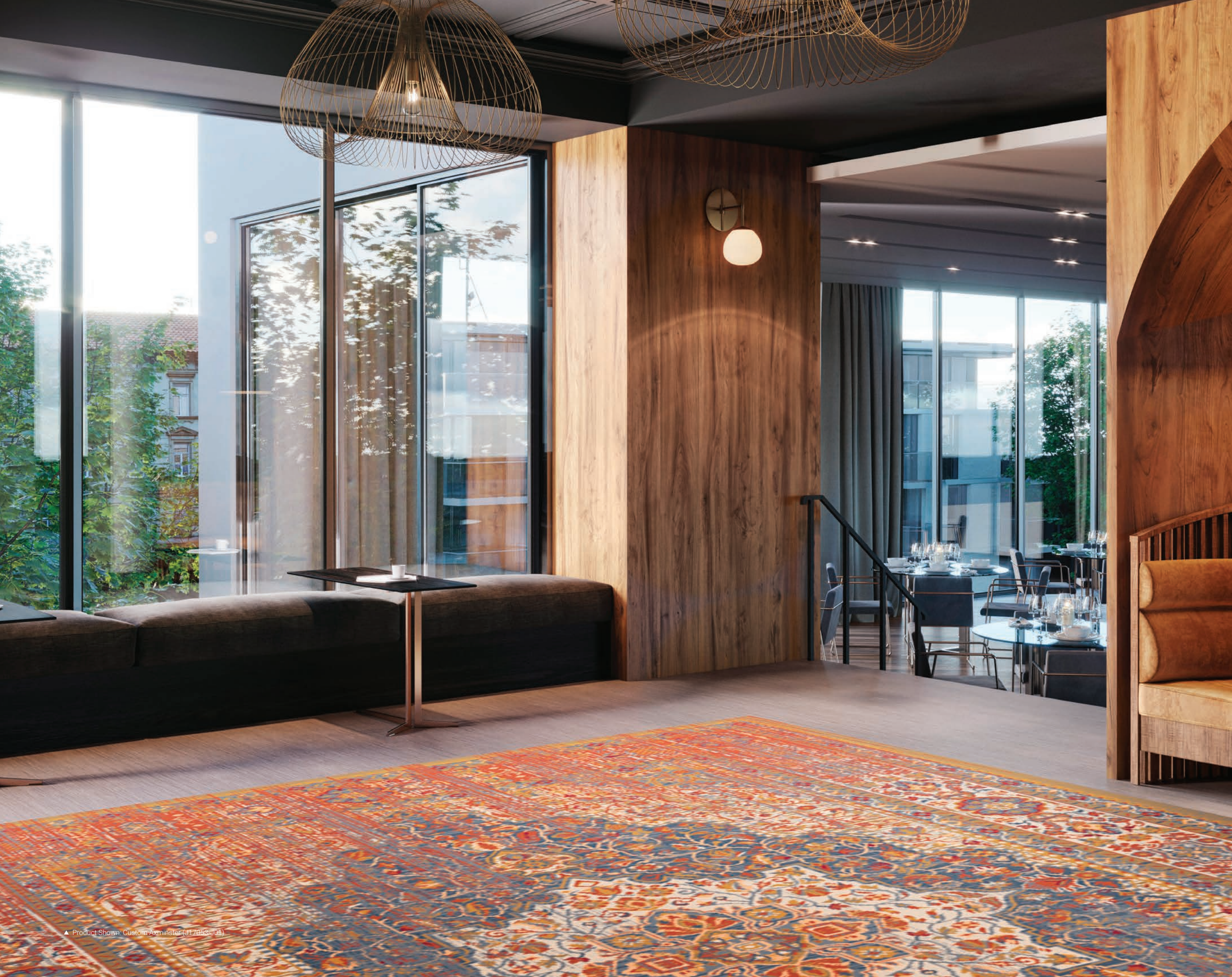
▲ Product Shown: Custom Axminster (J17053-J01)