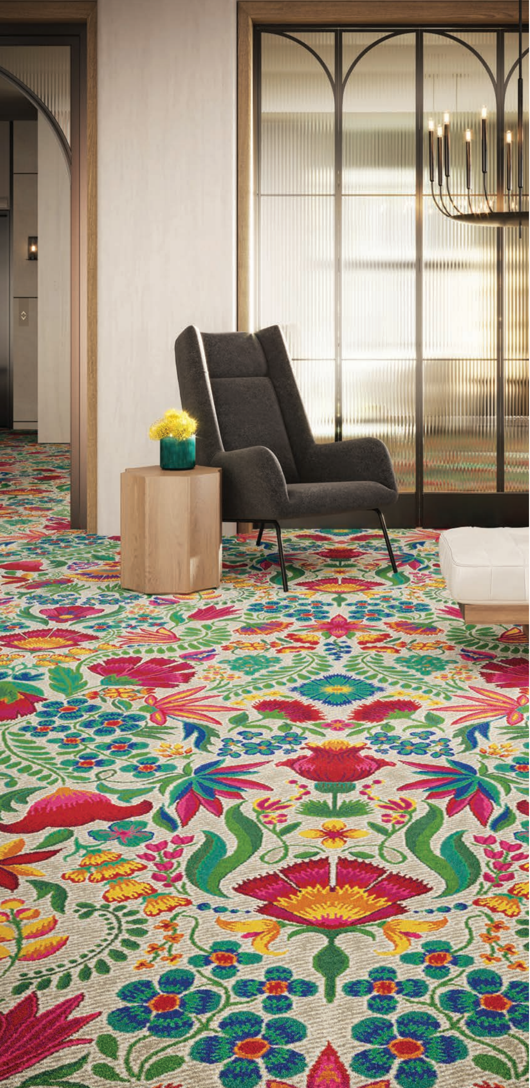
▲ Product Shown: El Alma II