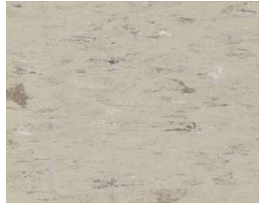
1365 Dark Taupe

Description: Vinyl Composition Tile Product: VCT-1365 Item Number: RF-02 Color/Finish: 1365 Dark Taupe Size/Dimension: 12" x 12" Material: Phthalate-free, 100% recyclable