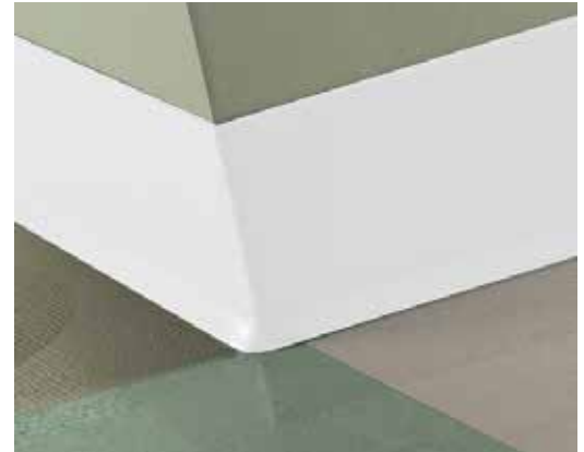
Traditional Rubber Wall Base 4" Duracove With Toe (Resilient)