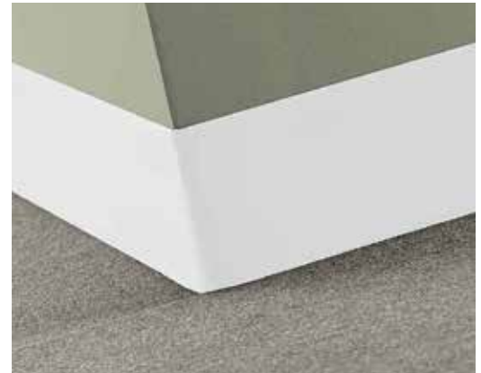
Traditional Rubber Wall Base 4" Duracove Toeless (Carpet)

No printed material contained here-in may be reproduced without written permission of Tarkett Hospitality. Due to variations in monitors, printers and light sources, we cannot guarantee that the colors in this image will be an exact match to your colors. 285 Kraft Drive Dalton, GA 30721