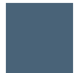
84 Blue Jean