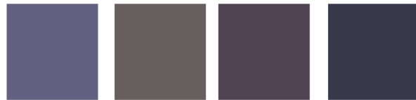
TB4 Grapest TG9 Poetry Plum 162 Sovereign 14 Tropical Storm