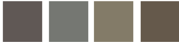
TB1 Peppercorn 282 Vaporize 276 Mystical 264 Grounded