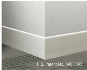
Mandalay 4.5" MW-XX-H 2.5" MW-XX-H25 3" MW-XX-H3 6" MW-XX-H6

Recommended Millwork Masquerade™ profile