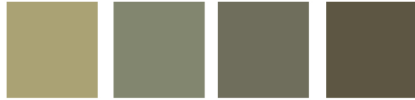
151 Iguana TH1 Glenhaven 190 Greege TB2 Boxwood