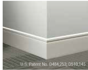
Reveal® 4.25" MW-XX-F M W 6" MW-XX-F6 8" MW-XX-F8