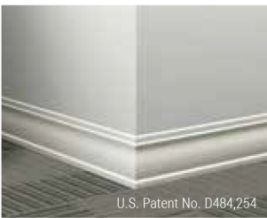
Outline® MW-XX-D W