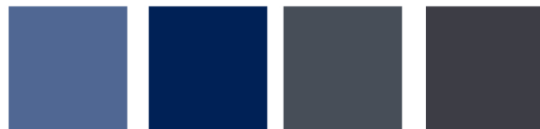
106 Skinny Dip 83 Midnight TH3 Inkwell TA9 Indigo