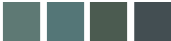
59 Heather Green 293 Peacock 73 Palm Leaf 72 Harbour