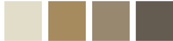
77 White Pearl W 67 Old Gold 176 Brass WB 66 Either Ore