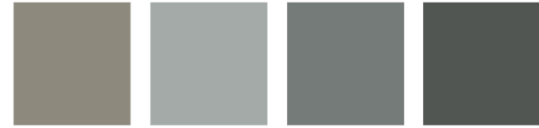
179 Steel WG 69 Sterling Silver CG 178 Ironstone CG 82 Black Pearl B

Color plays a key role in the Tarkett Solution SPECTrum™. After all, color has the power to motivate students in the classroom or soothe healing patients. It can stimulate excitement at retail stores or enhance safety by preventing a bad fall. By coordinating all flooring and accessory solutions across a balanced, harmonized palette, you have the freedom to bring your spatial design ideas to life. Express your creativity through the kind of environments where happiness and productivity thrive together.