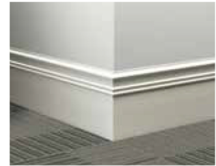
Monarch 6" MW-XX-M