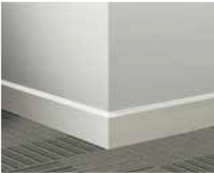
Oblique MW-XX-N W

Recommended Millwork Masquerade™ profile