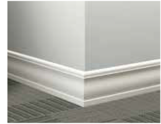
Silhouette® MW-XX-J W