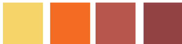
T67 Canary 62 Tangerine Tango T68 Spicy Chip TB6 Flame