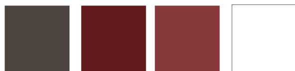
284 Ganache 15 Cabernet 163 Salsa 00 Unfinished