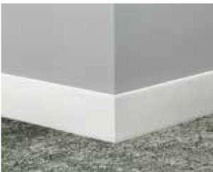
Monument® 2.5" MW-XX-S25 4" MW-XX-S4

Color Foundations™ is our commitment to always have representation across 6 key neutral palettes. For our complete color offering, reference color guide in back.