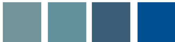
41 Sea Breeze 192 Tidewater 84 Blue Jeans 70 Bluest