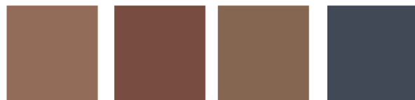
33 Adobe Peach 113 Chestnutty TA7 Rusty Nail TH2 Blue Intensity